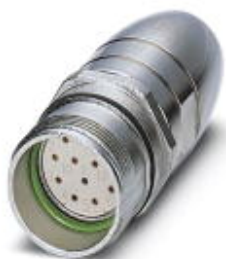
Coupling connector, straight, shielded: yes, Screw locking, M23, No. of pos.: 12, type of contact: Socket, Solder connection, cable diameter range: 7.5 mm ... 9.5 mm

Please be informed that the data shown in this PDF Document is generated from our Online Catalog. Please find the complete data in the user's documentation. Our General Terms of Use for Downloads are valid ( http://phoenixcontact.com/download )